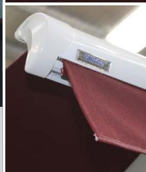
FRONT RAIL GUTTER